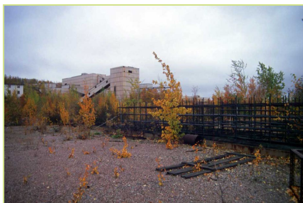
The Gunnar uranium mine in Saskatchewan.

Decommissioned uranium mines and decommissioned mill tailings in the Uranium City area of northern Saskatchewan are an ongoing source of contamination to Beaverlodge Lake and other nearby watersheds. Uranium and selenium levels are well above Saskatchewan Surface Water Quality Objectives. 25 The Gunnar uranium mine on the northern shore of Lake Athabasca is scheduled for remediation by the Saskatchewan Research Council. Originally a source of uranium for the nuclear weapons industry, remediation on the site is so complex to manage that estimated remediation costs have ballooned to over $200 million. 26