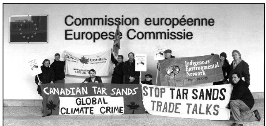
Groups protest outside the CETA talks to voice concerns about tar sands - the privatisation of public services, water, agriculture, corporate power and democracy.

In the hands of a more environmental steward this might not seem such a bad thing. But the Canadian government has already proved its willingness to use trade tools to undermine effective climate policy abroad.