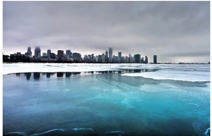
Chicago, Lake Michigan.

The Great Lakes of North America are in serious trouble. Multipoint pollution, climate change, over-extraction, invasive species, and wetland loss are all taking their toll on the watershed that provides life and livelihood to more than 40 million people and thousands of species that live around it. Once thought to be immune from the water crisis that threatens other parts of the world, the Great Lakes are a source of increasing concern as residents watch their shorelines recede, their beaches close and their fisheries decline. Added to this mounting ecological crisis are growing conflicts as some eye these waters for commercial bulk and bottled water export, mining, oil and gas exploration, private control of once public water services, and as an incentive to lure water-intensive industries to locate on them.