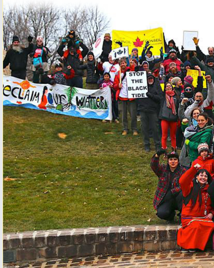
Defend our Climate, Defend our Communities event in Winnipeg, November 2013.

10 According to year-end weekly activity reports www.manitoba.ca/iem/petroleum/wwar/index.html