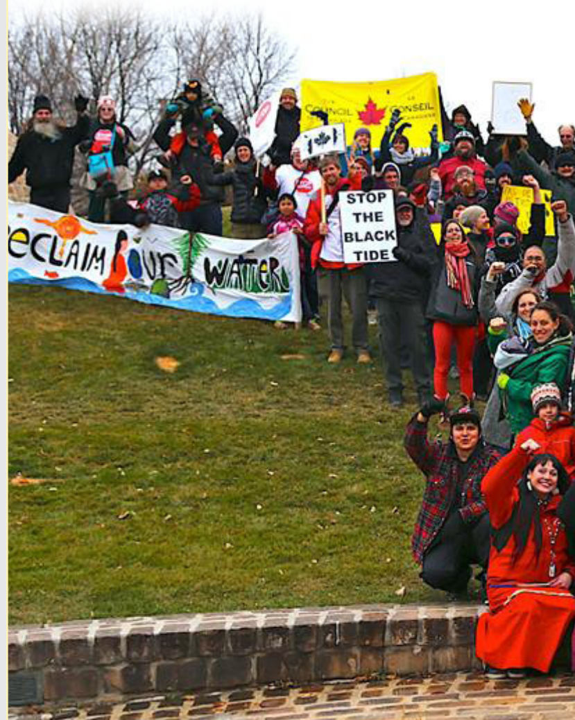
Defend our Climate, Defend our Communities event in Winnipeg, November 2013.

10 According to year-end weekly activity reports www.manitoba.ca/iem/petroleum/wwar/index.html