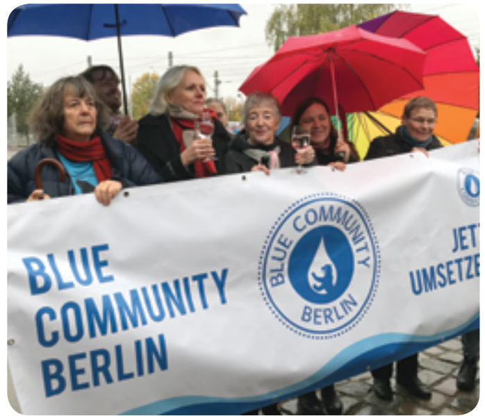
Maude Barlow (centre) was in Germany in December celebrating four new Blue Communities. The cities of Augsburg, Berlin, Munich and Marburg all received designations for their commitments to water.