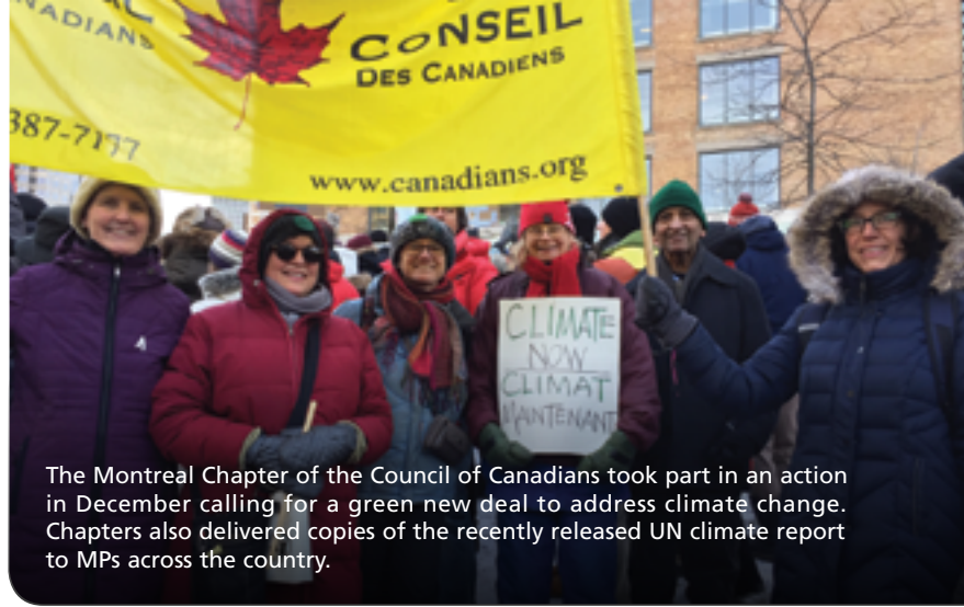
The Montreal Chapter of the Council of Canadians took part in an action in December calling for a green new deal to address climate change. Chapters also delivered copies of the recently released UN climate report to MPs across the country.

Council of Canadians chapters help put campaigns and social and economic justice issues in the spotlight in communities across the country. Chapter activists continue to be busy protecting water and public health care, challenging unfair trade deals, calling for urgent and immediate action on climate change, and to standing up for democracy. Here are just a few examples of their recent actions: